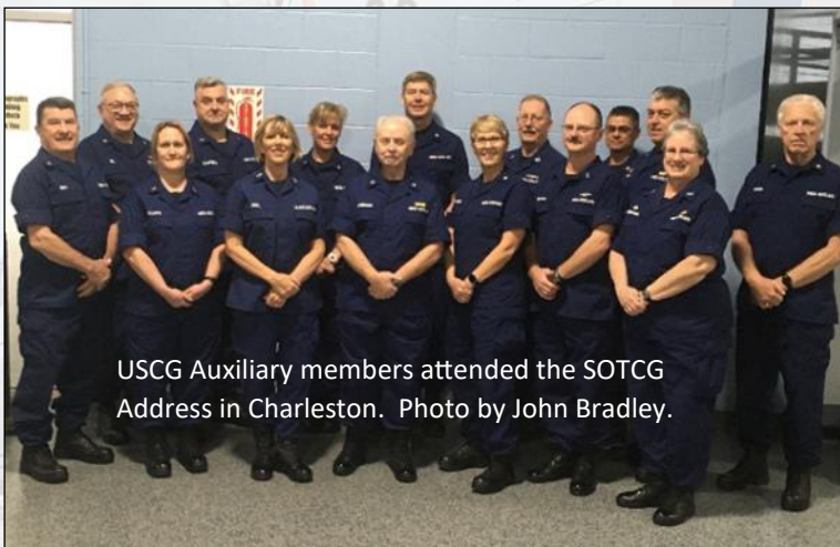
USCG Auxiliary members attended the SOTCG Address in Charleston.

See the entire SOTCG Address here: https://www.youtube.com/watch?v=IFei0Nahrkk